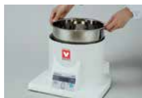
BM500 The electric kettle style tank can be removed freely