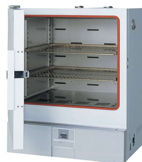
Interior of DKM600C